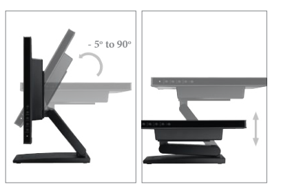
Flexible dual-hinge stand design to maximise viewing comfort for multiple users

Integration of 10-point touch and projected capacitive touch technology provides accurate and precise touch experience