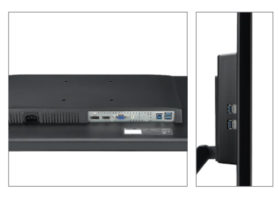
Versatile connectivity: VGA, HDMI, DisplayPort and USB port allow for effortless system integration